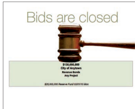
2. Bidding concludes...