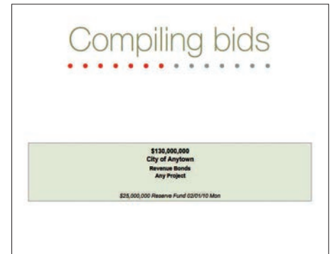
3. Bids compiled and summarized